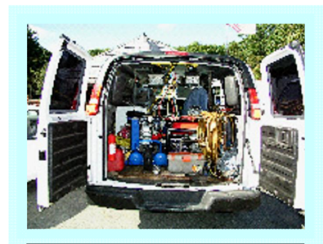
Mobile Recovery Unit

**This is $1.00/unit savings to our Members until further notice!!!