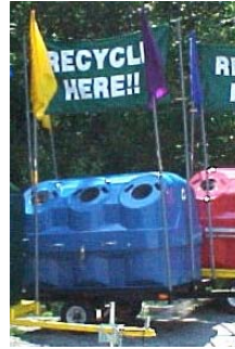
An NRRA RecycleMobile