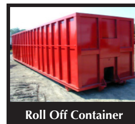
Roll Off Container